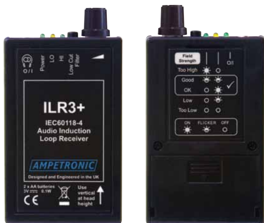
ILR3+ front view

The loop checking system comes with an easy to follow procedure for checking any loop system.